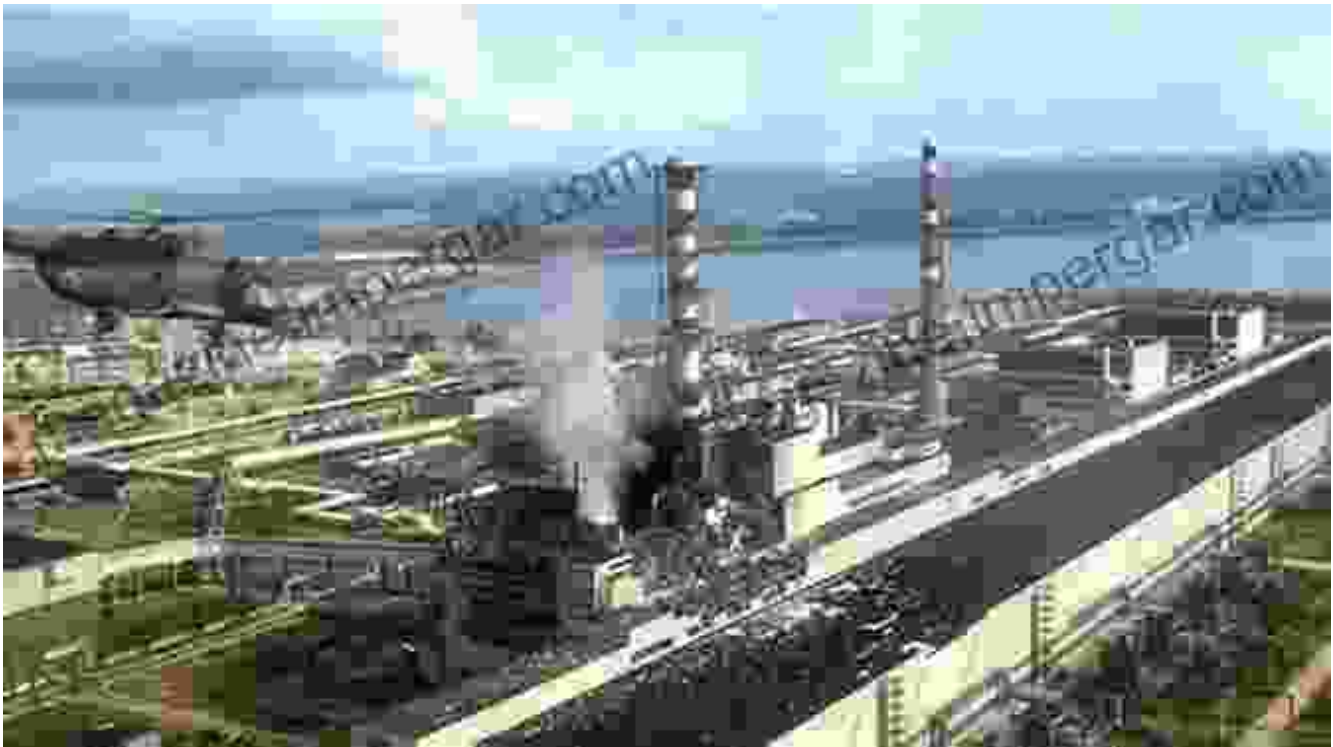
The Chernobyl disaster, 1986

However, the rise of nuclear power was not without its setbacks. In 1957, a fire at the Windscale nuclear power station in Cumbria, England, released radioactive material into the environment, casting a shadow over the industry. Then, in 1986, the catastrophic Chernobyl disaster in Ukraine dealt a major blow to the reputation of nuclear power worldwide.